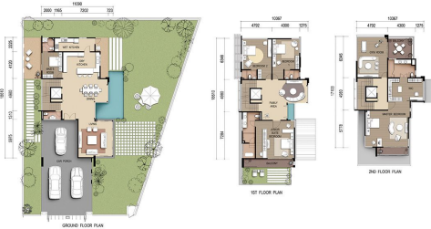
FLOOR PLAN - BUNGALOW HOUSE