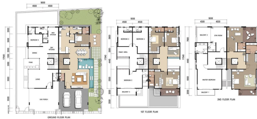
FLOOR PLAN - SEMI-DETACHED HOUSE