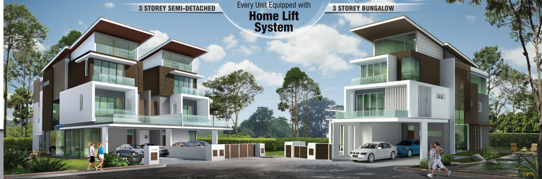
3 STOREY SEMI-DETACHED

Every Unit Equipped with Home Lift System